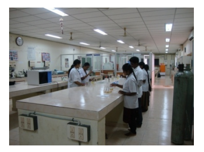
Evaluative Report of the Departments