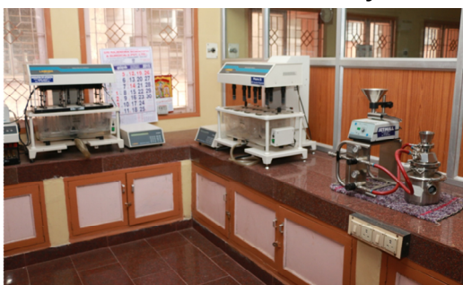
Jet Mill and Dissolution Test