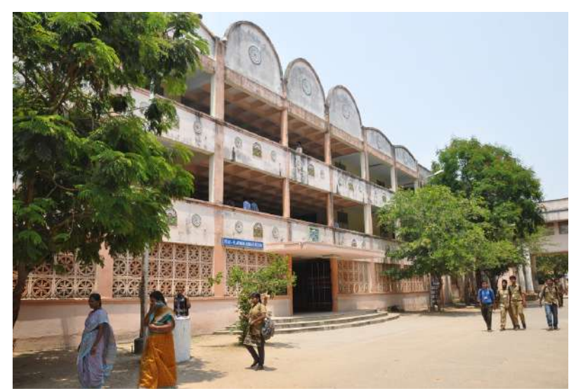
Class Rooms Platinum Jubilee Block