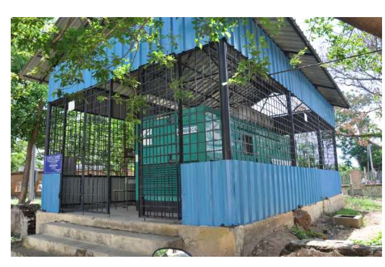
24 x 7 Uninterrupted Power Supply