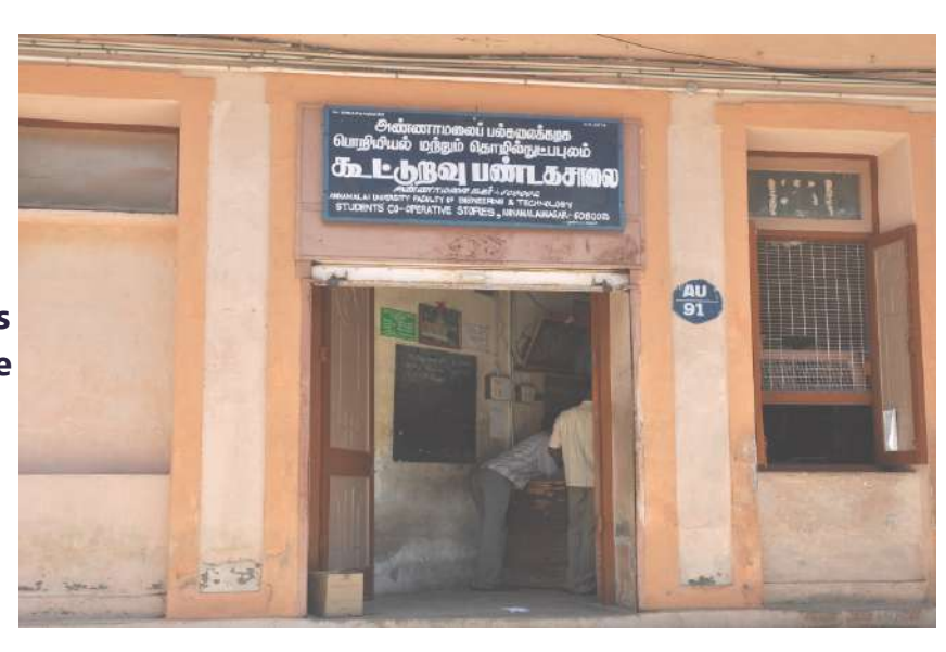
Student's Co-op Store