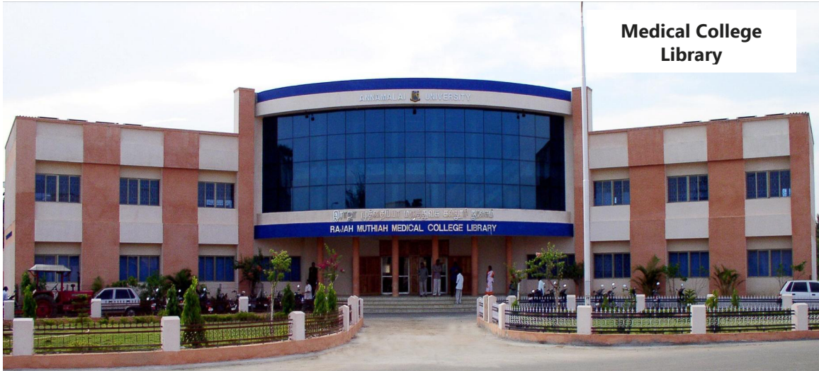
Medical College Library