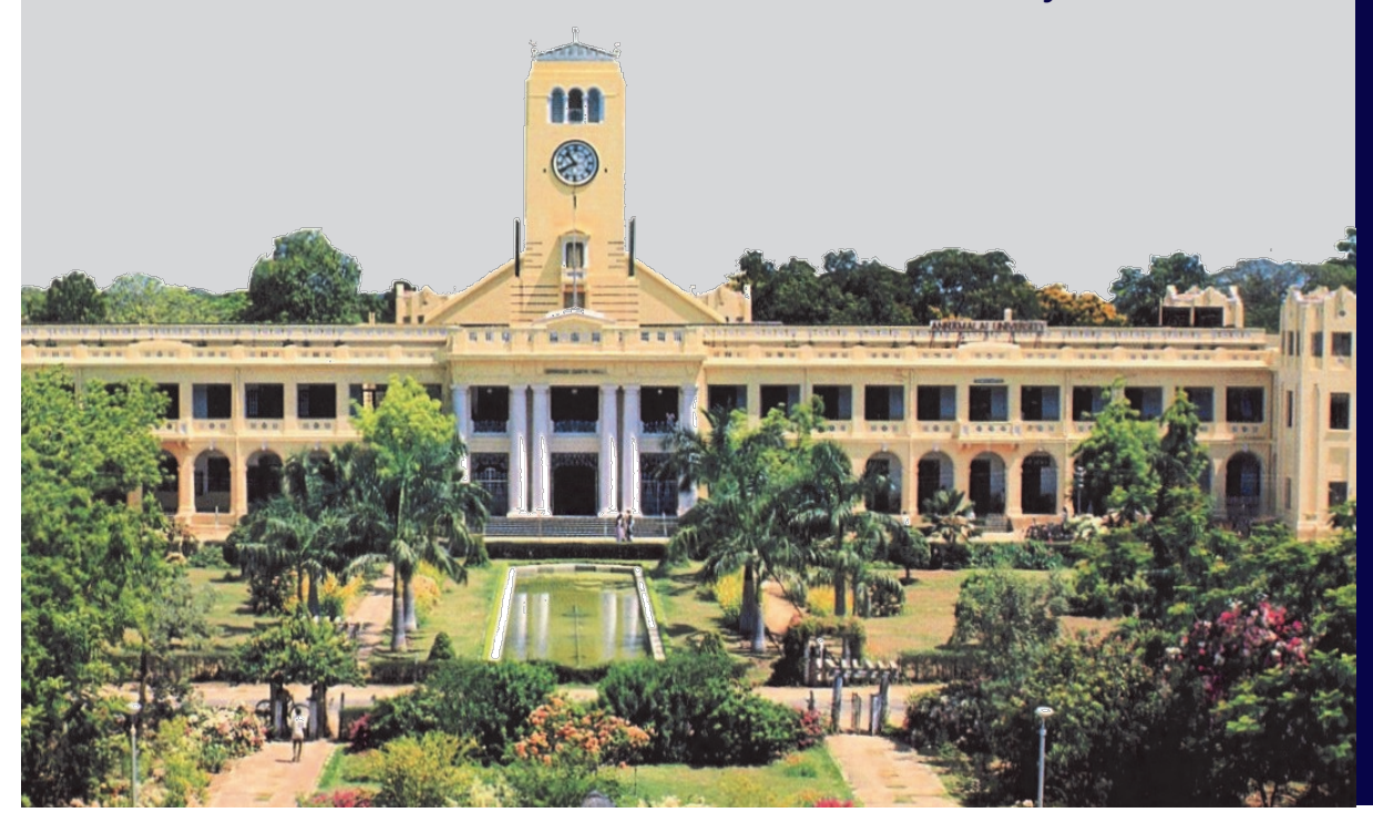
For details visit www.annamalaiuniversity.ac.in

Established in 1929, Annamalai University, accredited with 'A' Grade by NAAC in 2014, is one of India's largest public residential universities with Ten Faculties and 49 departments of study. The University has initiated several innovative teaching programmes over the years and has been a pioneer in distance education. Annamalai University has a commendable track record in projects and publications and has been awarded the PURSE Programme by the Department of Science and Technology. Nineteen departments are supported by UGC-SAP, Sixteen by DST-FIST and two departments have attained the status of Centre of Advanced Study. The University has been rated Seventeenth in the country among the Top 100 institutions of Higher Education and Second in the State by SCImago Institutional Ratings. Annamalai University has joint research and innovation partnerships with 24 institutions across the USA, Europe, Australia, Japan, and the UK. The list of partners include prestigious institutes like Karolinska Institute, John Hopkins University, and University of Michigan amongst others. Two of the most notable international collaborations in which Annamalai University is the Co-ordinating Institute include the Indo-EU FUNCFOOD Project and the 21st Century Indo-US Knowledge Initiative. There are several ongoing research projects with international foundations and industrial players like Bayer, CavinKare, Dow Agrosciences, Bill & Melinda Gates Foundation, HCL, L&T, Accenture, and Huawei.