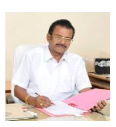
K.Ponnusamy Ex. Education Minister, Tamil Nadu,