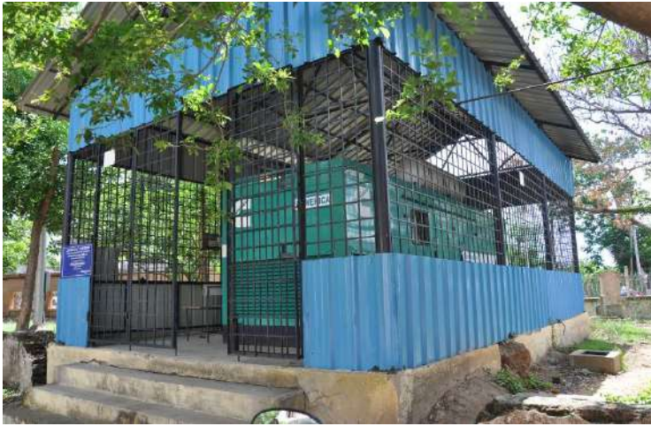
24 x 7 Uninterrupted Power Supply