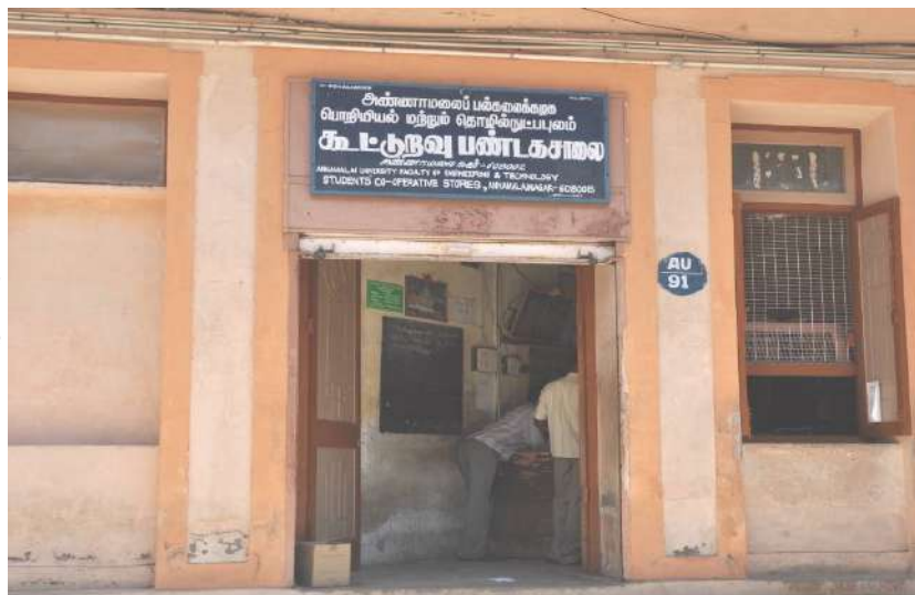
Students' Co-op Store