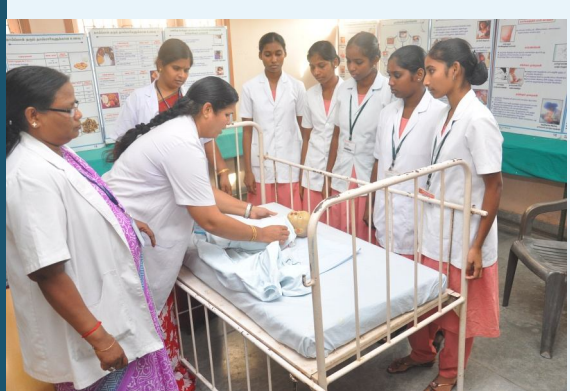
Paediatric Nursing lab