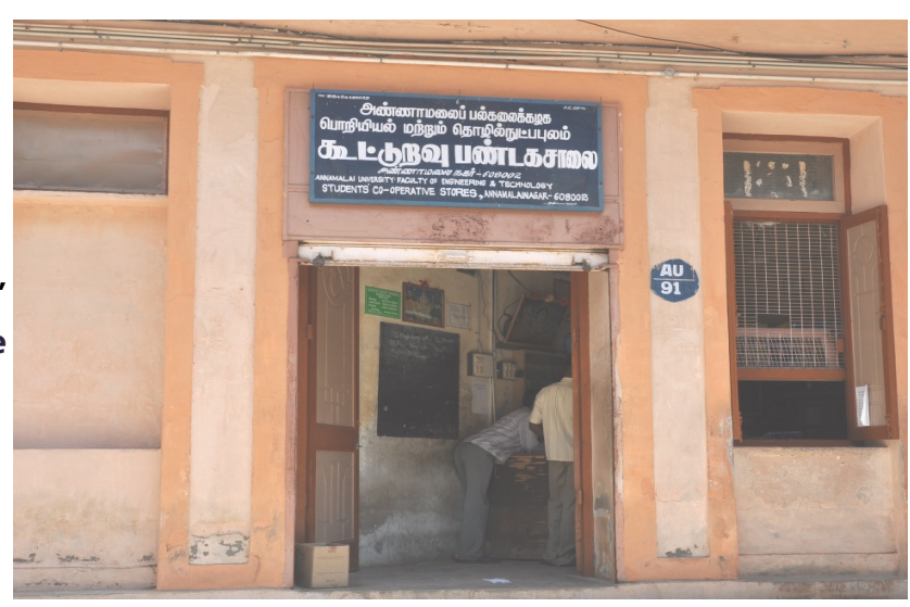
Students' Co-op Store