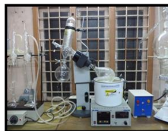
ROTARY VACUUM FLASH EVAPORATOR