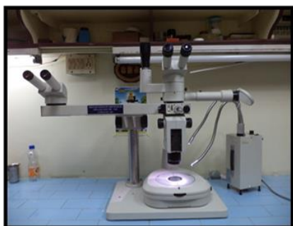
TRINOCULAR STEREOSCOPIC ZOOM MICROSCOPE