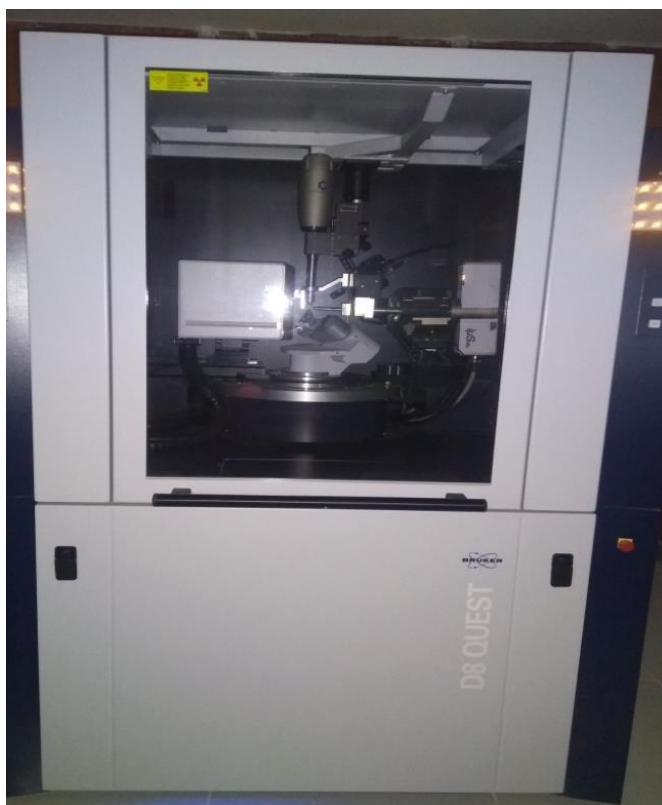
Single Crystal XRD (Bruker)