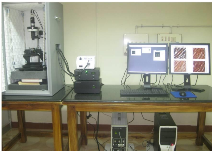
Atomic Force Microscope (AFM)