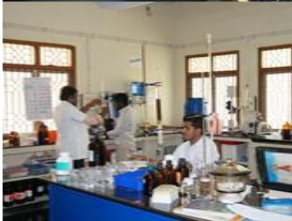
Instruments Lab - Marine Sciences