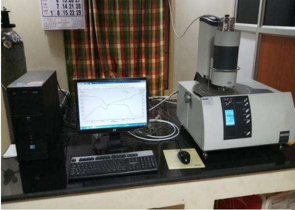
Simultaneous Thermal Analyser (STA)