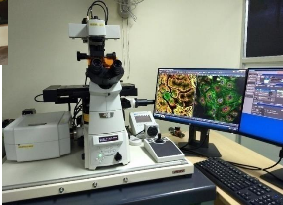
Laser Scanning Confocal Microscope (LSCM)