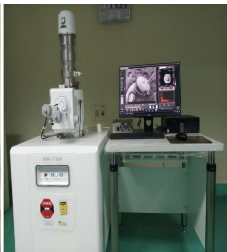
Scanning Electron Microscope - EDS (SEM-EDS)