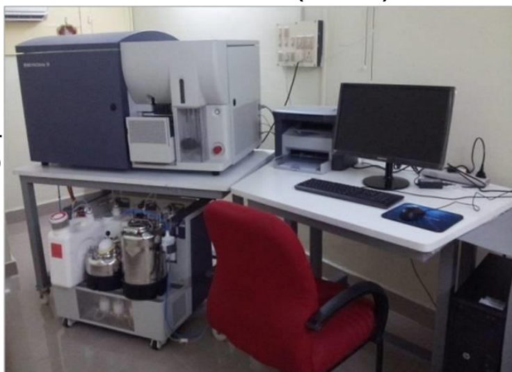
Flow Cytometer Cell Sorter (FACS)