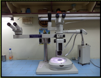
TRINOCULAR STEREO SCOPIC ZOOM MICROSCOPE