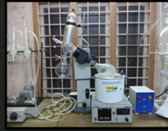
ROTARY VACUUM FLASH EVAPORATOR