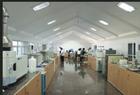
Instruments Lab - Marine sciences